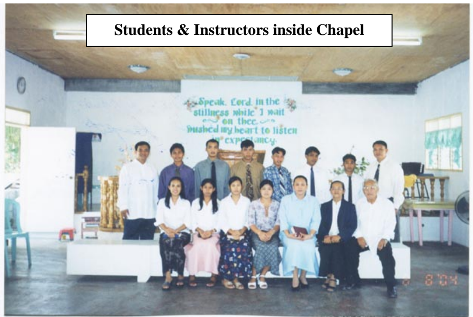
Students & Instructors inside Chapel

Presently, we resume with our hectic schedule classes & God willing by last Sunday of August, we'll have extension Youth fellowship with the brethren in Cuambogan, Tagum before I finally return to Manila. Thanks a lot for all your extended support to the seminary & God Bless.