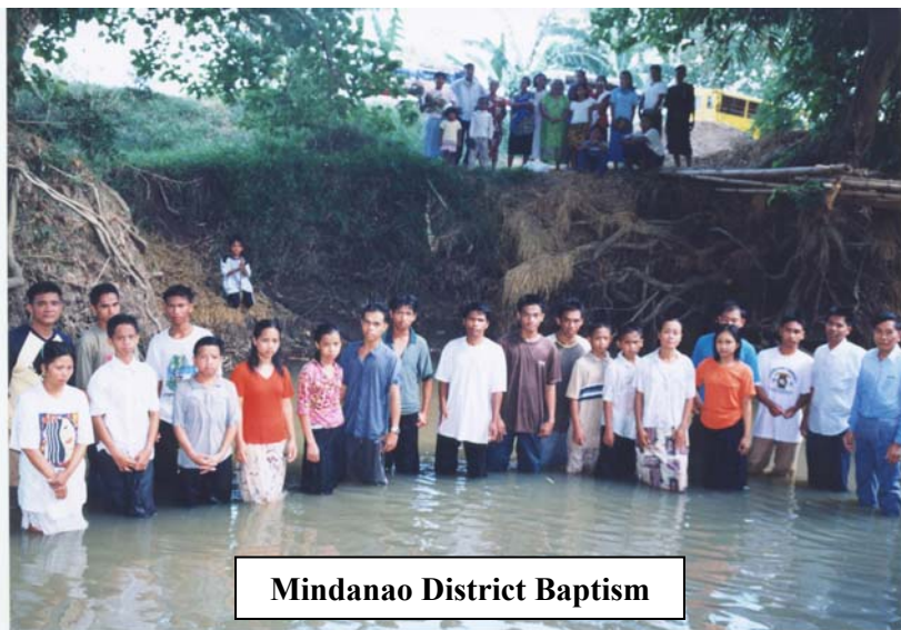
Mindanao District Baptism

In the time of rejoicing of Thotapally Church dedication, I praise God for I am privileged to say few words about the church; this is one of our ten churches.