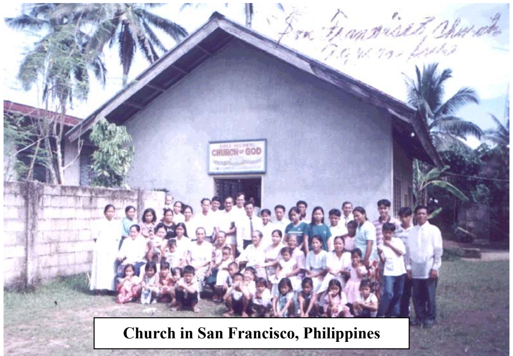
Church in San Francisco, Philippines

If you have become bitter and sour, it is because when God gave you a blessing you hoarded it. Yet if you had poured it out to Him, you would have been the sweetest person on earth. If you are always keeping blessings to yourself and never learning to pour out anything "to the Lord," other people will never have their vision of God expanded through you.