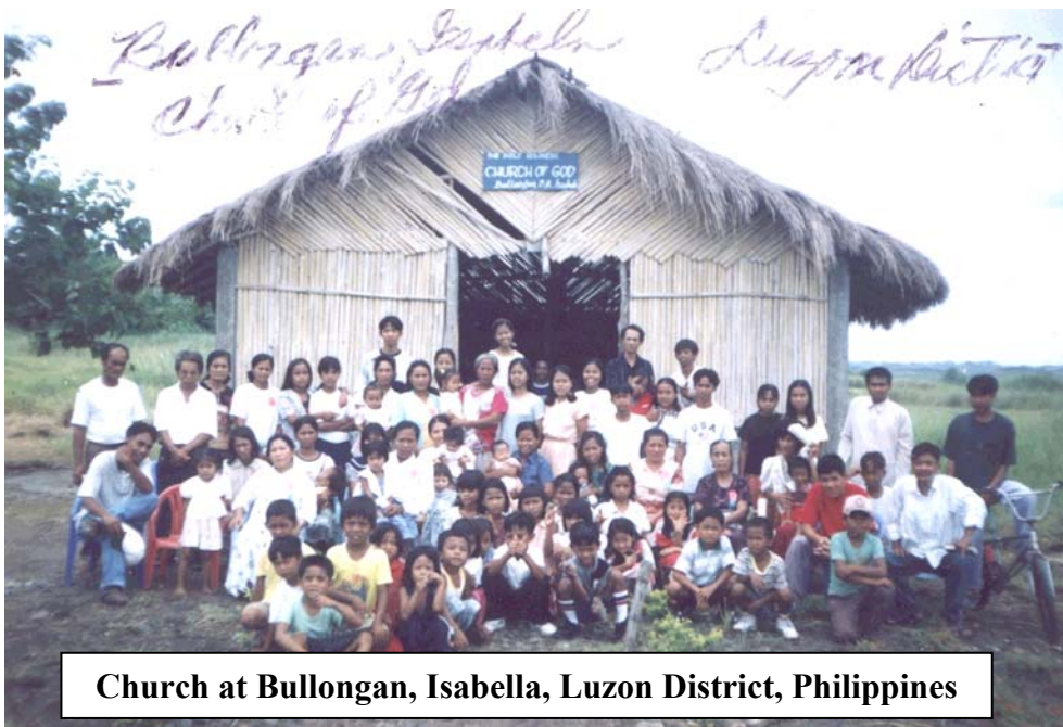
Church at Bullongan, Isabella, Luzon District, Philippines

Thursday Aug 24: I gave my testimony to a class of about 60 students at 7:30 AM. We departed at 9:30 for Aba. Some of the ladies from the mission went with their driver and escorted us to Ankpa and aided us in